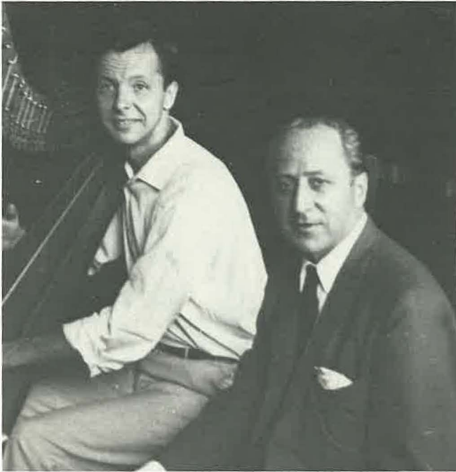
With Nicanor Zabaleta at a master class given by Zabaleta at Sienna, Italy