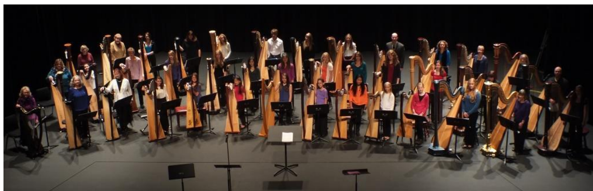
Harp Fantasia 2013. Lakewood Cultural Center, Lakewood, CO.