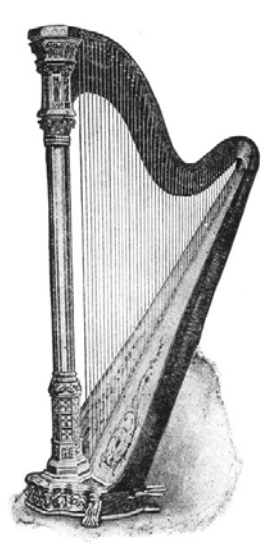
HARP. Height, 5 ft. 8 in.