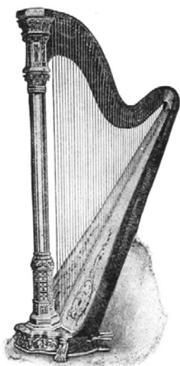
HARP. Height, 5 ft. 8 in.